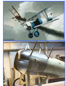
Siemens Shuckert D.IV Photos sent in by Jeff Schutic

Jim Suchy has two 1/3 scale WWI projects underway this building season. The first is a Siemens Shuckert D.VI. He is building from plans by Dave Johnson. This airplane appeared very late in the war, and utilized a geared rotary engine that swung a massive 4 blade propeller. The fuselage is completely round in cross section. The model is all built and ready to cover. Expected to fly in 2012.