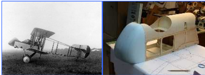
Left: Airco(Dehavilland) DH2 picture photo and under construction photo sent in by Jeff Shutic.

Jim's other project is an Airco (Dehavilland) DH2, also 1/3 scale. This airplane appeared early in the war and utilized a pusher engine to allow gun placement on the airplane's centerline. This design preceded the use of gun/engine synchronization by British forces. Jim drew up his own plans for this effort. The rearward placement of the pusher engine will require a lot of nose weight as the pilot and ammo load was part of the weight and balance equation of the full size aircraft. The model is well underway and is also expected to fly in 2012.